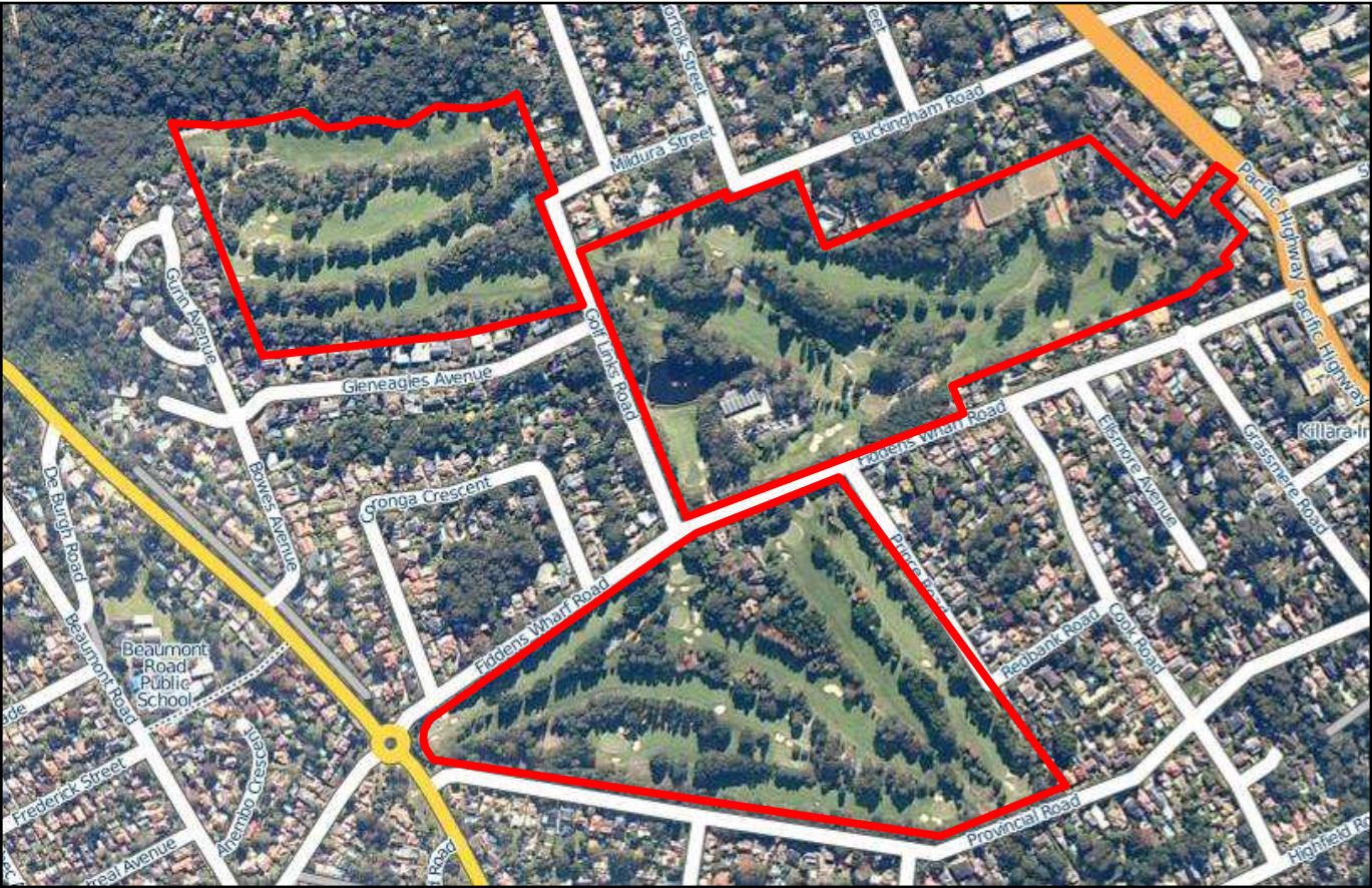
Figure 1: Aerial photo of the subject land