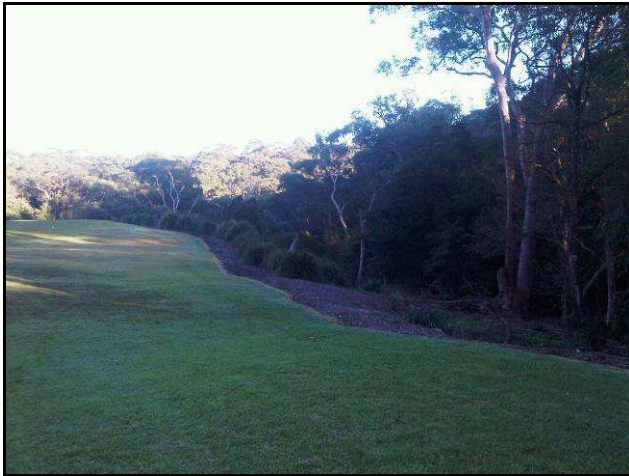
Photo 3: Area of proposed revegetation along Links Creeks to the North